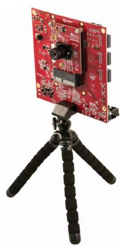
Fig. 5: Toshiba Industrial 1080P60 Camera Module, mounted on the MicroZed Embedded Vision Carrier Card [4; 4]