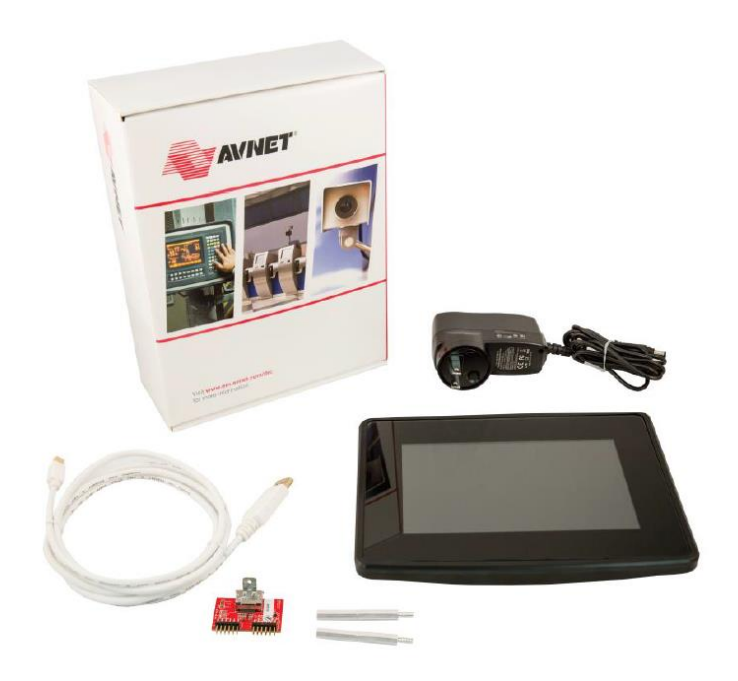
Fig. 3: Avnet's 7-inch Zed Touch Display Kit [1; 7]