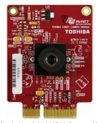
Fig. 4: Toshiba Industrial 1080P60 Camera Module [4; 5]