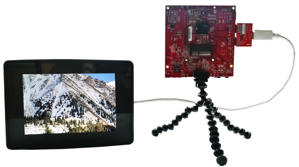
Fig. 6: Complete camera-to-touchscreen demo kit