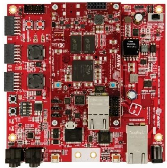
Fig. 2: MicroZed mounted on EMBV [4; 8]

Complete demo kit is illustrated in Fig. 6.